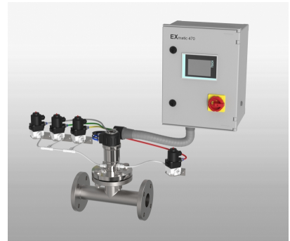
Measuring point with probe housing, flow-through fitting and control unit