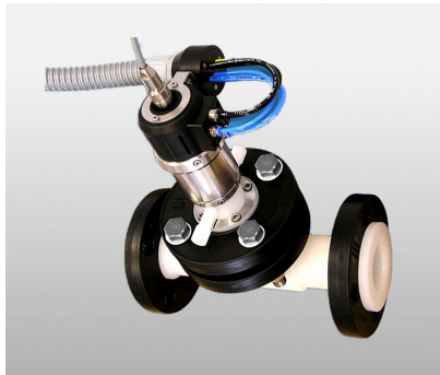
EXconnect connected to retractable probe housing