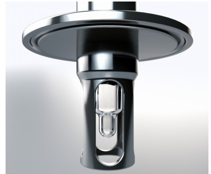
Version with protective cage