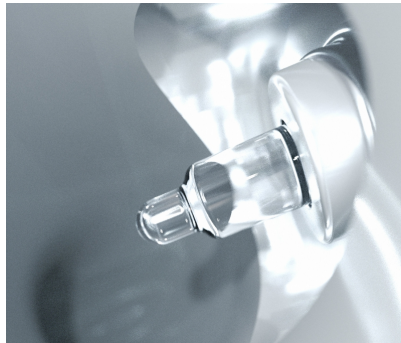
EXstatic - installation situation from inside