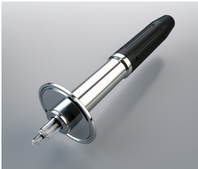
EXstatic 311 - version without protective cage